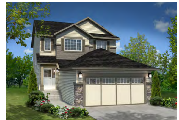
ENGLISH COUNTRY ELEVATION w/ Optional Stone

© Copyright, 2004 - 2011. This plan is the property of Lincolnberg Homes Ltd. Floorplans, specifications and dimensions shown are approximate, and are subject to change without notice. All rights reserved, including the right to reproduction in whole or in part. Rendering(s) are artist concept only.