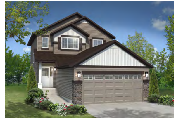
ELEVATION W w/ Optional Stone