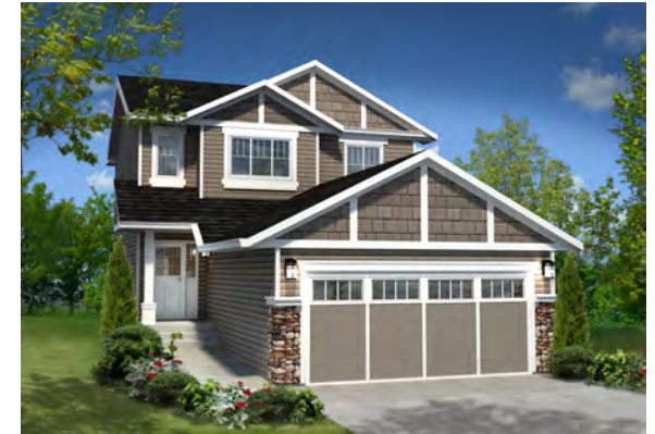
CRAFTSMAN ELEVATION w/ Optional Stone